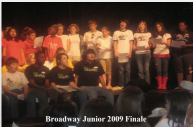
Broadway Junior 2009 Finale