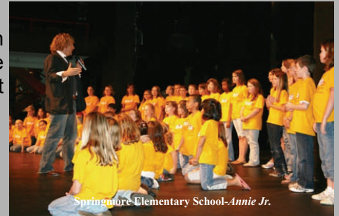
Springmore Elementary School- Annie Jr.