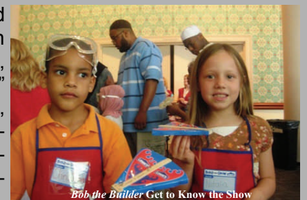
Bob the Builder Get to Know the Show