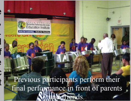
Previous participants perform their final performance in front of parents and friends.