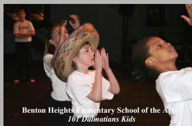
Benton Heights Elementary School of the Arts- 101 Dalmatians Kids