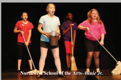
Northwest School of the Arts- Annie Jr.