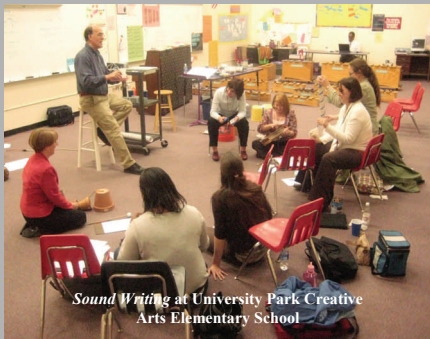
Sound Writing at University Park Creative Arts Elementary School