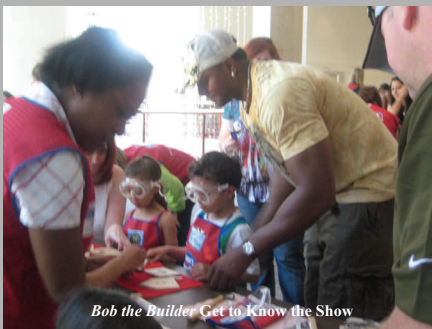
Bob the Builder Get to Know the Show

The Blumenthal Center's Education Institute and Lowe's Home Improvement collaborated on Sunday, April 26 th , 2009 in the Belk Theater lobbies to host a free Get to Know the Show workshop in support of the Bob the Builder Live performance. Lowe's featured its fun "Build and Grow Clinics" where approximately 100 kids were guided through the steps to build toys and other fun objects like a birdhouse, a hang glider, and a rain catcher. Everyone was given a toolkit to build something and learned about safe use of tools, plus received goggles, an