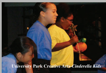
University Park Creative Arts- Cinderella Kids