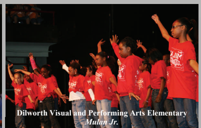
Dilworth Visual and Performing Arts Elementary- Mulan Jr.